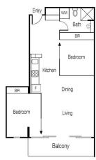
215/1 Danks St PORT MELBOURNE 3207 (VG)

215/1 Danks St PORT MELBOURNE 3207 (VG) Agent Comments